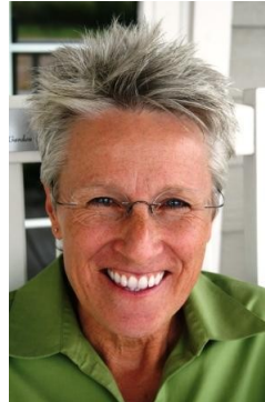
Executive Director, Kansas Sampler Foundation

Please Join Us to Hear About Her Travels Throughout Kansas & the Work She Does Exploring, Promoting & Enjoying RURAL KANSAS!